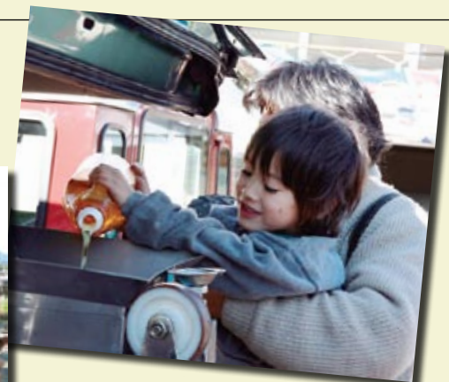
People with donation