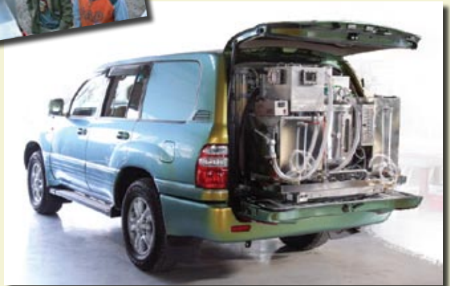
The vehicle with the compact BDF conversion system installed.