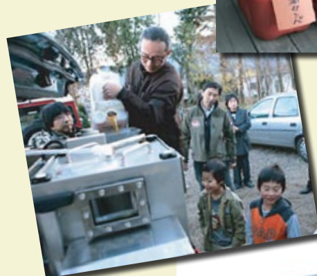
Visiting a school in the country side.