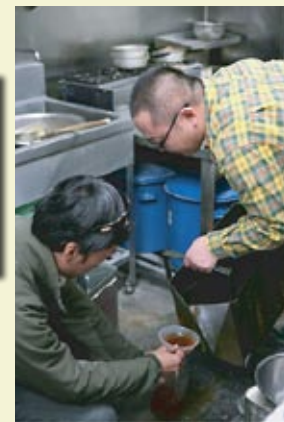
Collecting WVO from the kitchen.